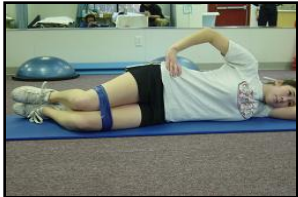
Figure 1: Closed Position